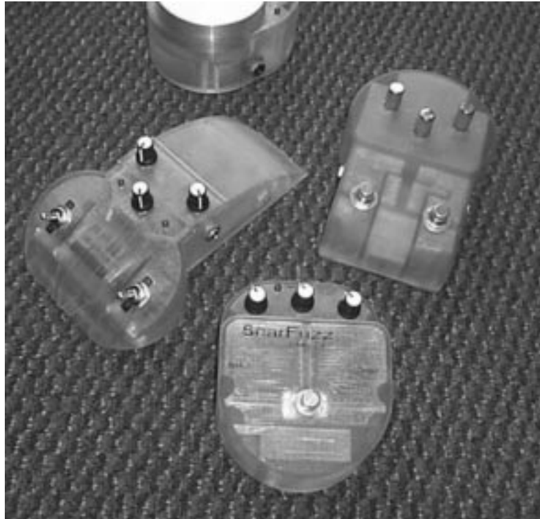
Fig. 2. Completed guitar effects pedals designed by the students.

NSF) has created a rapid prototyping center that features: