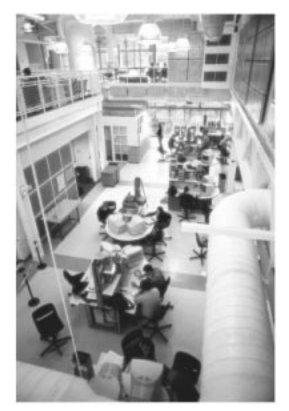
Fig. 1. One of two hands-on laboratory plazas in the ITL laboratory.

this desire with a First-Year Engineering Projects course as a counterpoint to the large, impersonal lecture classes in core mathematics and science classes [3]. In this one-semester course, which is required of some, but not all, engineering majors, students work in teams to design, build and test functioning prototypes, while honing valuable oral and written communication skills. About 14 sections serve more than 400 students annually.