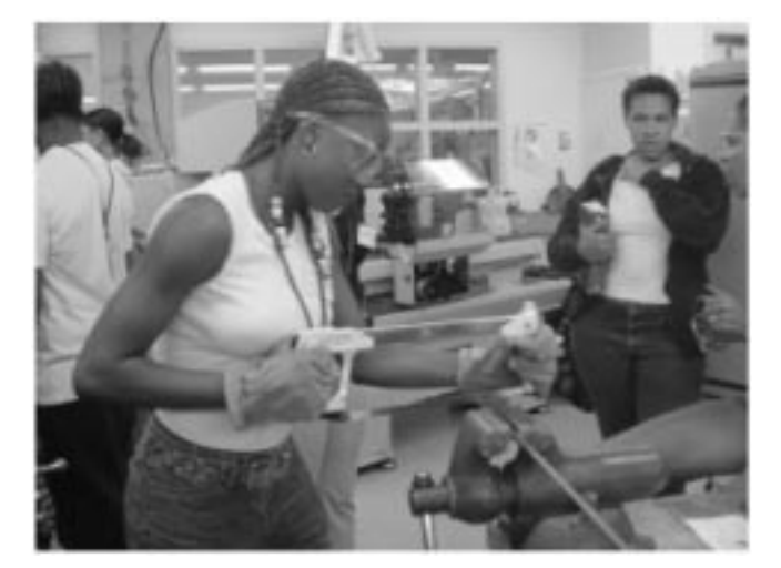
Fig. 6. Students work in the Manufacturing Center to create their stereo speaker team project.

It always works on paper! This is one of the main reasons why hands-on design, as opposed to abstract theoretical design, is critical to gaining an