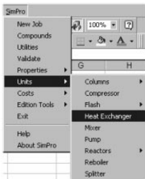
Fig. 3. SimPro menu.

Guthrie [7], updated by Marshall Swift's index (M&S) [7].