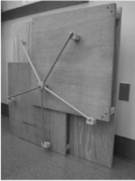
Fig. 4. Final prototype of the juggling kinetic sculpture.

reproducibility remained the two issues that students wished they had more time to work on. For example, the motor was underpowered for turning the sculpture arms due to all of the frictional losses that students were unable to account for in their early calculations. Although disappointed with not being able to complete a ‘perfect’ sculpture, students found incredible pride in their work and a sense of accomplishment. It was the process of creating the sculpture that students reported mattered to them the most.