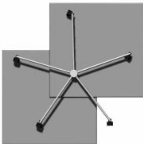
Fig. 1. Initial concept for the juggling kinetic sculpture.

The students built a quick prototype of this sculpture, shown in Fig. 2, using paper cups and tinker toys to get a feel for how the project might