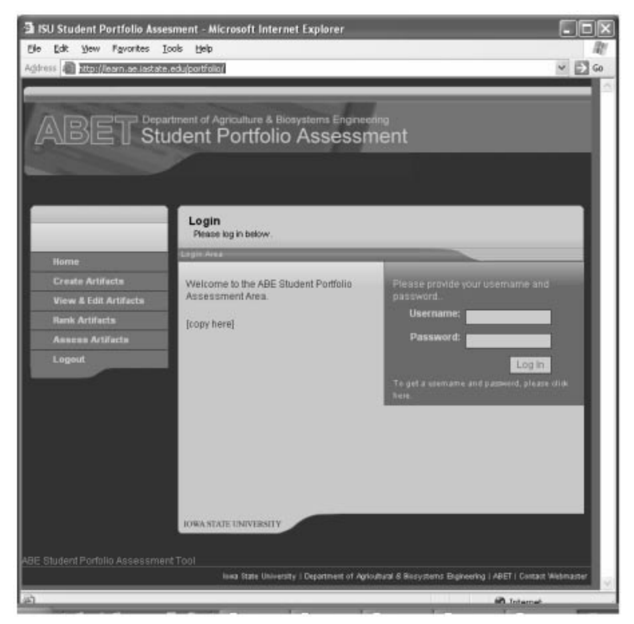
Fig. 4. The ABE ePortfolio System introduction screen.

Students upload artifacts that demonstrate achievement of one or more competencies. These artifacts can be papers they have written, examinations, laboratory reports, videos of presentations, design projects, or any form of evidence the student chooses that can be stored electronically. Artifacts, however, are not restricted to formal class settings. They can include internship experiences, student club activities, service learning projects, volunteer work, or any extra-curricular experiences that help demonstrate the competencies. Students must attach a reflection to the artifact by explaining its significance and impact. They must also self-assess the artifact, rating it on a Likert Scale for each of the key actions associated with the competency.