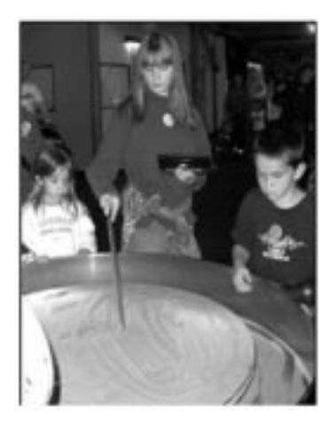
Fig. 4. Children using PDA at interactive science museum.

Covering educational material—When adopting new technologies and educational resources an important consideration is their integration with existing educational content requirements.