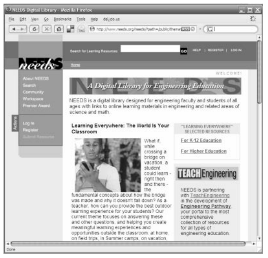
Fig. 1. NEEDS digital library theme page for Mobile Learning resources.