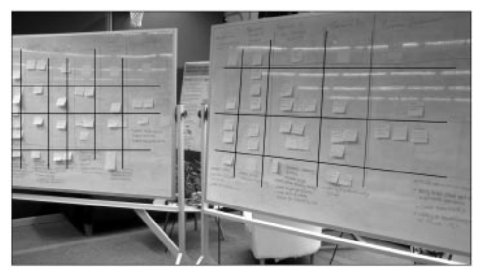
Fig. 3. Illustration of needs hierarchy and clustering analysis process.