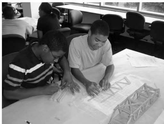
Fig. 2. Phase I participants on Warren truss bridge building.

To fully engage the students in engineering, we have developed a theme-based approach to the SEI. The theme-based approach starts with Phase I and ends with Phase IV. Phase I is designed for rising 7th and 8th graders. This phase introduces students to the practice of engineering by conducting projects, such as Bridge Building and Failure Analysis , Circuit Analysis , Logic Blocks , and Solar Car Design and Racing (see Fig. 2), and familiarizes them with engineering as a profession . Following this is Phase II, which is designed for rising 9th and 10th graders, exposes its participants