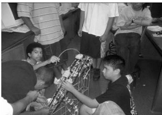
Fig. 3. Phase II, Building and testing a colloid roller coaster.