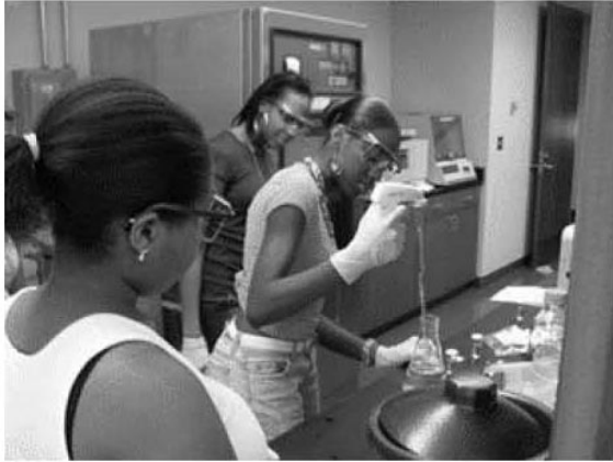
Fig. 7. Phase III, Getting hands-on experience in the Stem Cell Research Lab.

data. It would be difficult to present high school students with statistical methods without showing them how it relates to something they already know and understood. As a student wrote on the survey form: