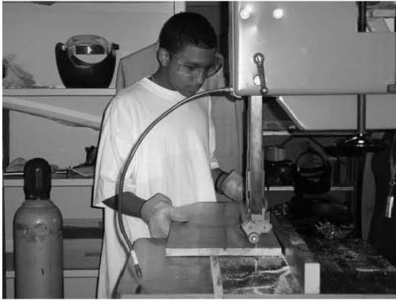
Fig. 4. Phase III, Getting hands-on experience in the machine shop lab.