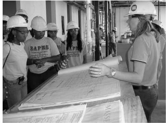
Fig. 6. Tour of Massey Cancer Building construction in downtown Richmond.