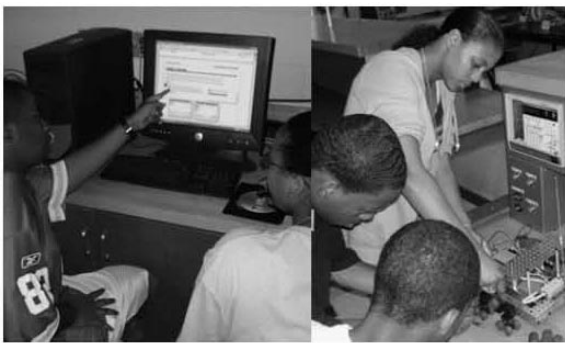
Fig. 5. Phase IVA, Programming and building Vex- robots.

to Applied Engineering and Computer Concepts , all of which supplement their robotics, Roller Coaster Design , New Lego Mindstorm NXT , Parallax Boe-Bots , and K'nex Car Design and Racing Projects (see Fig. 3).