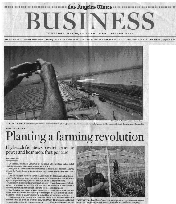
Fig. 2. A Dutch-Canadian-American farming revolution [13].

resource concerns to innovation and good design and engineering in a very positive way. Early in the days of the environmental movement it was routinely argued that ecological concerns were in an adversarial trade-off with economic growth because the environmental benefits were seen to be social (or society's) benefits, whereas the costs of cleaning up or preventing pollution were private costs that would be borne by industry. However, the argument goes, it should be recognized that pollution represents an inefficient use of resources that typically results from excess or wasted manufacturing by-products. Good design and innovation that is aimed at reducing these polluting by-products results in resource productivity that enhances profits [14].