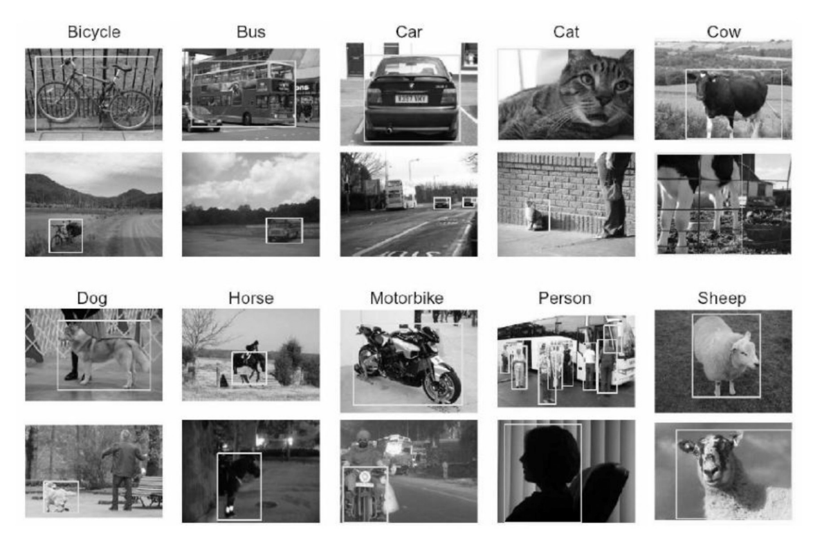
Fig. 1. Classification PASCAL Challenge. Image examples for ten different object classes. Note that this object classification problem is not trivial due to changes in scale, rotation, perspective, etc. Many research groups are now using this PASCAL challenge as a benchmark for evaluating their research.