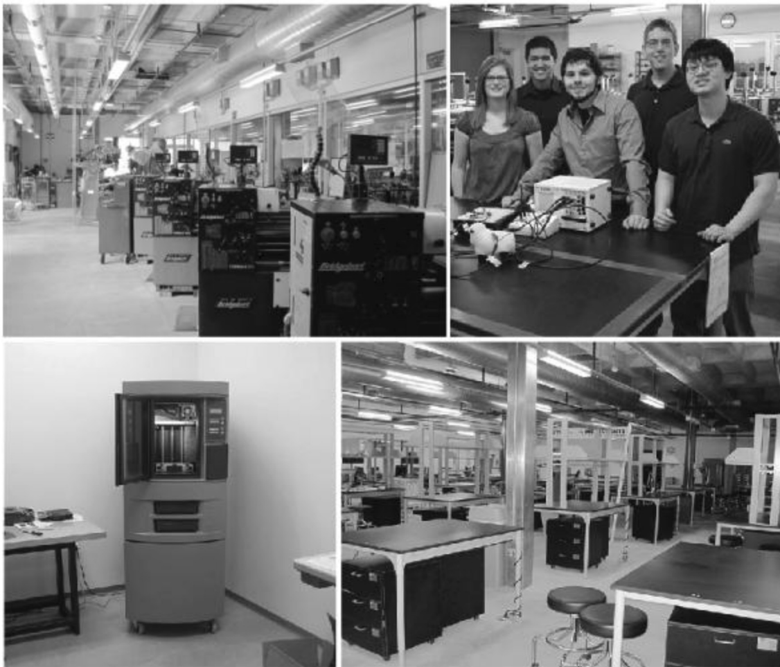
Fig. 1. Photographs of the Oshman Engineering Design Kitchen.

Prior to 2008, the bioengineering, electrical and computer engineering, and mechanical engineering departments had occasionally offered collaborative, interdisciplinary projects to their students. These efforts were sporadic and would only account for 2–5 teams (~10–15%) annually. These were challenging efforts because the various design classes had differing expectations and timelines that had to be modified to meet the needs of each department. In order to address these challenges, the three depart-