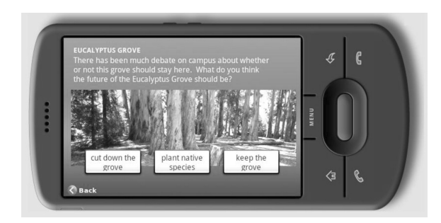
Fig. 3. Screenshot of Example Multiple-Choice Thought Questions in the GreenHat Mobile Prototype: There has been much debate on the campus about whether or not this grove should stay here. What do you think the future of the Eucalyptus Grove should be ?

Next, the students viewed videos of each expert at the location discussing the issues surrounding the controversy (e.g., the biologist explains that ivy is a non-native species that takes over where native species grow, so removing the ivy gives the native species a chance to re-sprout and thrive. The landscape architect explains that removing the ivy is labor intensive and expensive, as well as causing possible land erosion) (Fig. 4). Finally, the students were asked to respond to the topic question again, writing their rationale on the phone using the phone's keypad. We 'shadowed' each student with video cameras and field notes. After the tour, we asked a set of open-ended questions such as 'How was your experience in learning about Strawberry Creek?' [41]. The seven students who participated in the GreenHat Desktop condition had access to all the same digital material as the GreenHat Mobile condition (e.g., expert videos, campus map, key concepts in text) but received these materials on the desktop computer in a room. In both conditions, the students explored five different locations on the campus, following the multi-step inquiry, and with the same time allocation.