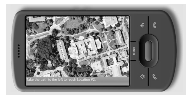
Fig. 2. Screenshot of Interactive Location-Sensitive Map in the GreenHat Mobile Prototype.