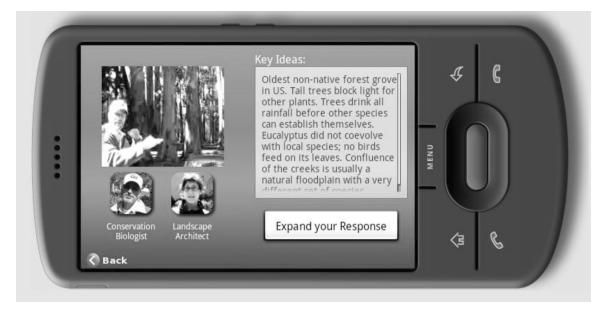
Fig. 4. Screenshot of Expert Videos with Key Concepts in Text in the GreenHat Mobile Prototype.

Our evaluation of the GreenHat prototype with college students showed that having access to multiple experts' perspectives in the physical environment, i.e., how the experts would look at and interrogate the very environment the students