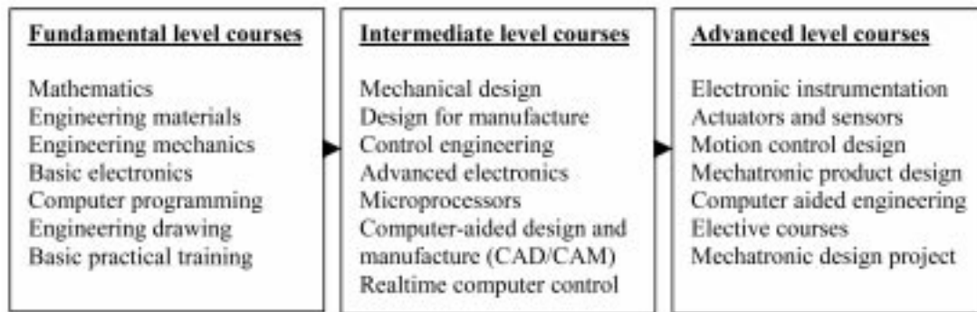
Fig. 1. Courses in mechatronics engineering undergraduate curriculum.

In many universities worldwide, mechatronics has been incorporated into traditional engineering curricula. The level of mechatronics education in a majority of the cases appears to have been confined to one or two courses at an appropriate level for undergraduate or postgraduate curriculum [6, 7]. A number of textbooks published on mechatronics also support the view of general understanding rather than intense treatment [12, 13]. While the mechatronics curriculum in general are oriented more towards robotics at graduate level, the focus of the undergraduate curriculum on mechatronics education at the City University of Hong Kong is strongly on in-depth learning to acquire integrated knowledge using theory, experimentation and group design projects [4, 5, 9]. The paper reviews the nature and structure of the mechatronics education, and the successful implementation of the undergraduate curriculum in training mechatronics engineers that have been under continuous improvement since 1992 at the City University of Hong Kong.